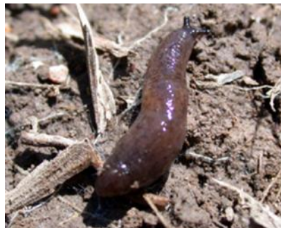
Figure 7. Grey field or garden slug

Don't forget the culprit here is the grey field or garden slug in Figure 7 . The field slugs are small and disappear into the soil during the heat of the day and are rarely seen compared to the larger ones you might see in your garden.