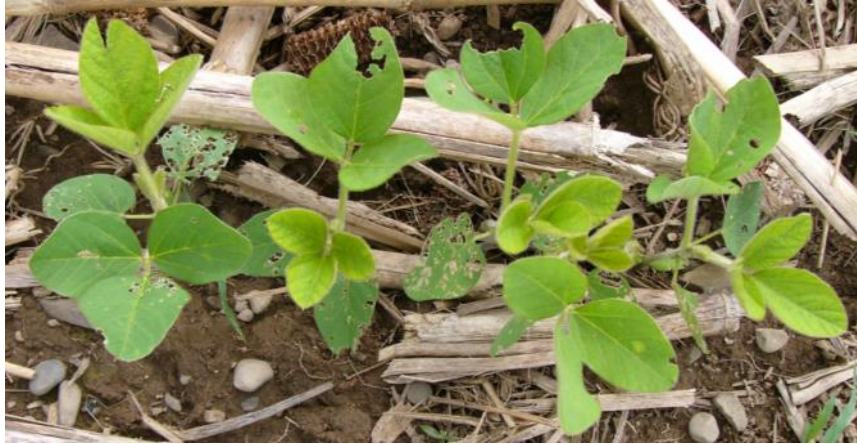
Figure 5. Slug damage to soybeans

can consume all of that top growth before the plant can add any new growth. This is usually worse in cool years when the soybeans aren't growing very fast. Whether soybeans (Figure 5) or corn (Figure 6), slugs are more often found where there is considerable crop residue around the plants and amazingly much less feeding where there is none.