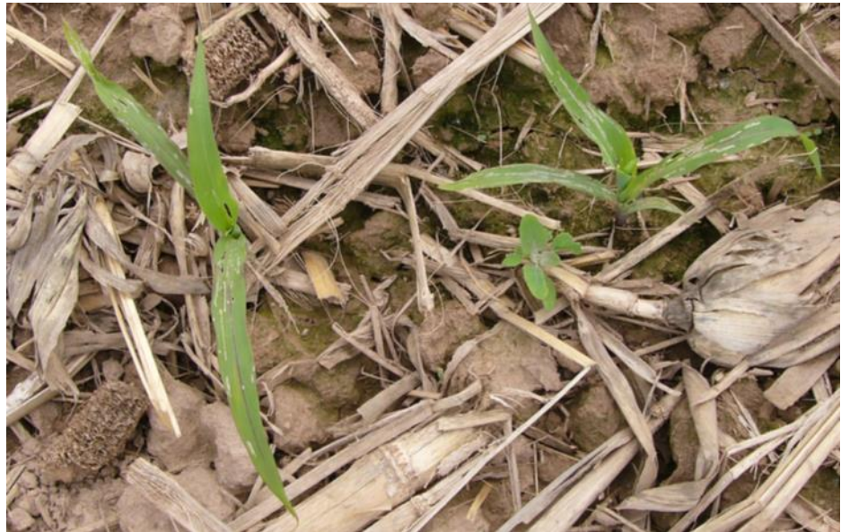
Figure 6. Slug damage to corn

Don't forget the culprit here is the grey field or garden slug in Figure 7 . The field slugs are small and disappear into the soil during the heat of the day and are rarely seen compared to the larger ones you might see in your garden.