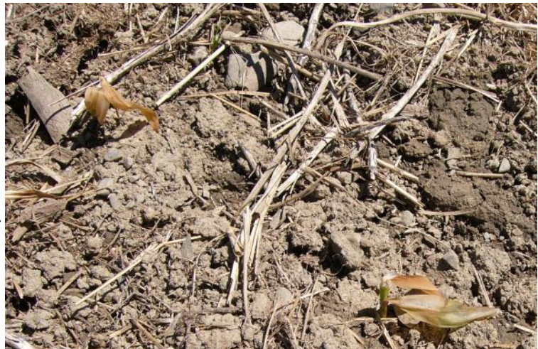
Figure 1, frost damage May 14, 2013, picture May 16

Unless the cold temps can reach 28° F that deep in the soil the growing point will remain intact. As you can see in Figure 1 temperatures which went below 28° F will kill off the top part of the plant, in this case mostly leaf area. But as in Picture 2 you can see that the stalk near or the below the soil surface is still alive. This is an important point. Because as long as the plant down to the growing point is alive and no rots of any kind have set in you have a viable plant