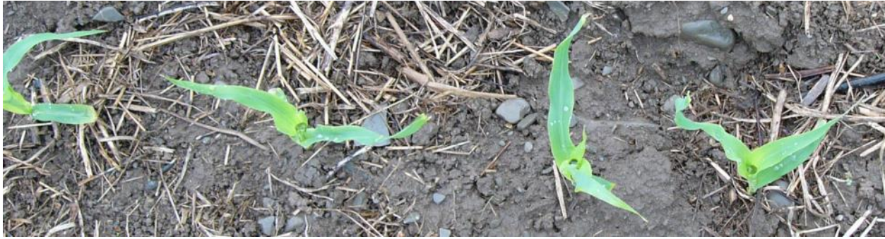
Figure 3. New growth on May 24, 2013

that will continue to grow. You can see the regrowth in Figure 3 which was taken on May 24, ten days later. You can expect some modest yield loss if the corn is taller when frosted as the plant does need to recover so is set back to some degree. But don't hit the panic button thinking you would need to replant.