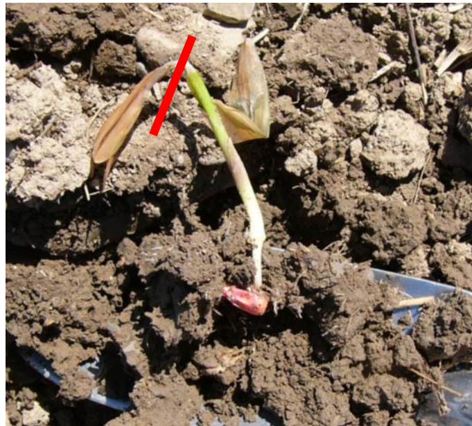
Figure 2, red line divides dead leaves above from healthy part of the plant below