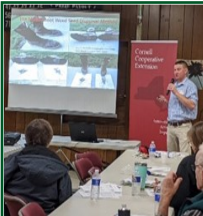
The Southern Tier Crop Congress was a huge success and widely commended by participants who travelled from the entire region.