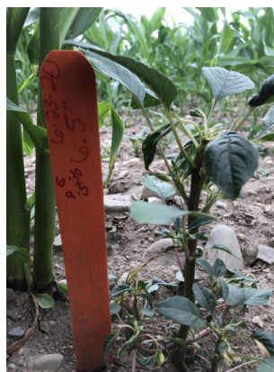
Conducting on-farm weed research on Palmer amaranth with weed scientist, Lynn Sosnoskie.

Recognizing that we are a new program still trying to build community awareness, we decided to increase the amount of press releases we released on topics related to our efforts. This quarter, our program developed 14 Press Releases on various topics, generating additional awareness, consultations, media requests, and general support of our program's efforts during the COVID-19 pandemic.