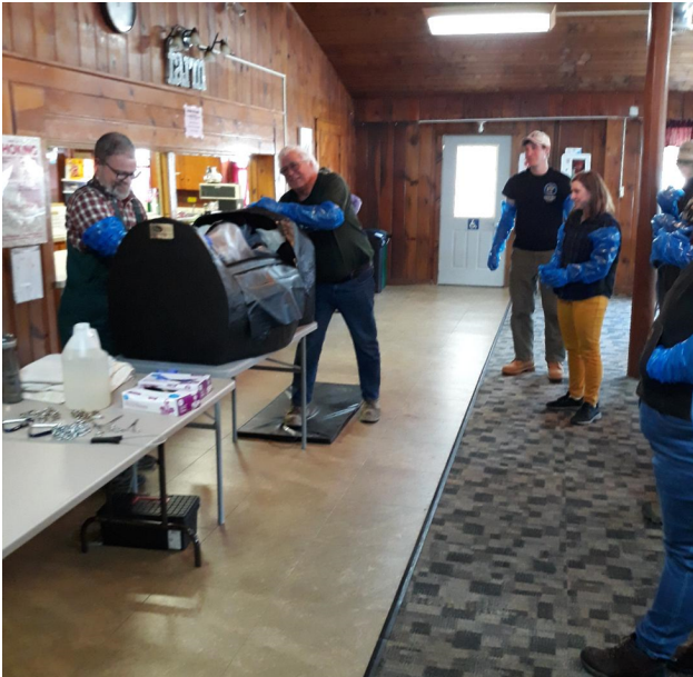
Student feeling the presentation of the model calf in the birth canal