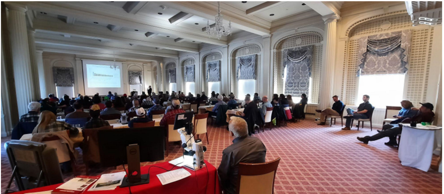
2023 Corn Day Conference

On February 14th, the CNYDLFC's annual Corn Day conference was held at the Otesaga in Cooperstown. More than 100 attendees were able to earn up to 2.5 DEC pesticide applicator recertification credits and 3.5 Certified Crop Advisor CEUs while learning the latest agronomic and IPM strategies for producing corn crops in our region. In addition to the conference, participants had opportunities to visit industry representatives at the first ever Corn Day trade show.