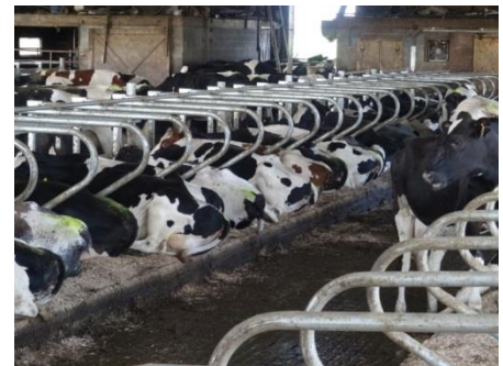
One look at these relaxed cows tells you how much they like their new waterbeds.

DAP is a partnership between the NYS Department of Agriculture and Markets and the NYS Department of Environmental Conservation that was announced in 2013. Through the program, farms can be awarded funding to help cover the cost of a business plan focused on growth, design of new or remodeled facilities or development of environmental and farmstead plans. When DAP was announced in the summer of 2013, dairy and farm business specialists jumped on board to help eligible farms apply for funding.