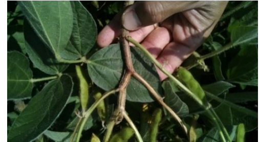
Northern Stem Canker