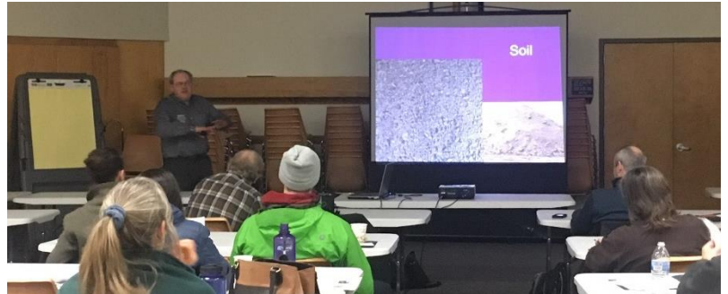
Regional Field Crop Specialist describes how moving soil can also move weeds at “The Pathways to Invasion: What is on Your Property?” meeting.