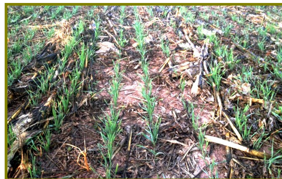
Cereal rye in the fall.

terminated rye cover as a means of maintaining living roots throughout the year and improving soil structure, higher seeding rates may not be as important. Veteran no-tillers that use rye as a soil health tool may go as low as 30 to 60 lbs./ac, although due to smaller seed sizes some may still be planting close to 1 million seeds per acre. Those that plant at lower rates cite reduced input costs, improved light penetration and airflow to the soil surface resulting in quicker drying in the spring and ease of planting when going into a standing cover crop, commonly referred to as "planting green".