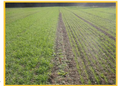
Early planted on left smothers weeds, resists spring heaving, yields more than later planted on the right. Both give high forage quality

Finally when you select your corn seed this fall, adjust for a shorter season crop to allow maximum yield of both the corn and the winter forage crop. You can drop 20 days in maturity and may only lose 3 tons of corn silage/acre (some shorter season varieties do not lose yield but equal the yield of longer ones). It is replaced with 5.5 - 10 tons of higher milk producing winter forage. ♦