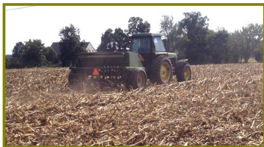
Drilling cereal rye after corn harvest

A study rye of planting dates at the Big Flats (NY) Plant Materials Center showed seeds per pound for rye varied from under 12,000 to over 33,000 based on the cultivar. Assuming traditional small grain seeding rates of 1.5 million viable seeds per acre and a germination of 85%, pounds of seed per acre would vary from 53 to 147 to hit the 1.5 million seed mark. While many older cultivars may have been accurately planted at 2 bu./ac., knowing your rate of seeds per pound and the germination rate of the seed can better help determine how many total pounds should be hitting the field.