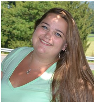
Organic Dairy Assistant