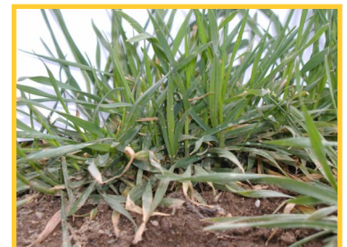
Shallow planting allows spring heaving to push the plants up so the roots dry and the plant dies. Picture to the right was planted correctly in the same field and had no heaving.