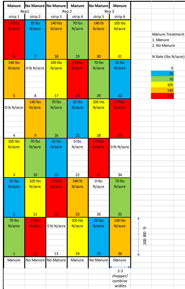
Figure 2. Value of Manure Plot plan