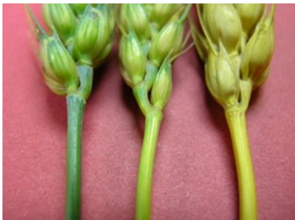
Figure 2: Wheat Before (left) and At Physiological Maturity (right)