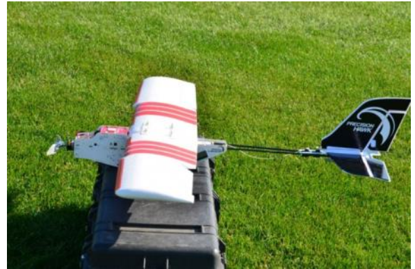
Figure 1. CCE's UAS platform

It depends how you use it. As long as you fly your UAS under 400 ft, are more than 5 miles away from the nearest airport, fly only during daylight hours, obey visual flight rules, and do not use the UAS imagery to make a management decision on your crops or livestock then as a hobbyist you would be in compliance. However if you use the UAS imagery to, for example, write a prescription for variable rate nitrogen on corn, even if it's fed to animals, you would be in violation of the law. A change in management = commercial UAS use. We have obtained FAA approval to conduct research on a small number of farms in western NY to evaluate management changes based on UAS imagery beginning in 2015.