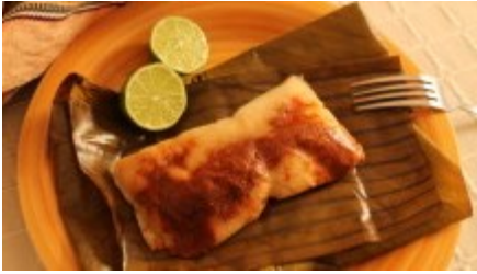
A Guatemalan tamal steamed in a banana leaf.

Even though we live thousands of miles away from Guatemala and Mexico, tamales seem to magically appear on dairy farms throughout New York