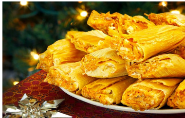
Mexican tamales wrapped in corn husks.

State around Christmas time. Have you ever wondered why your Hispanic employees might be so attached to this holiday tradition?