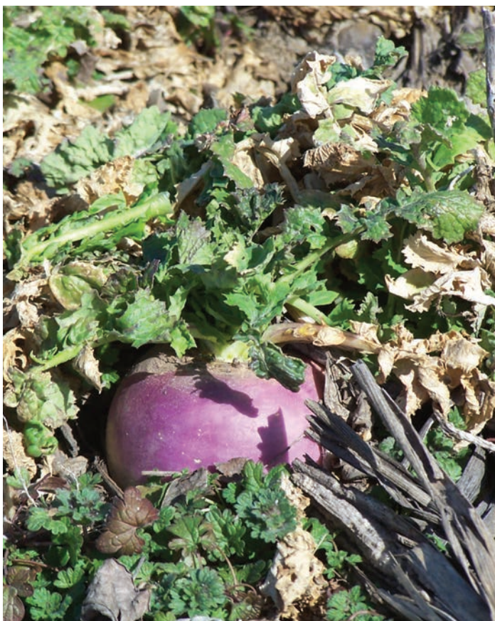
Turnip growing in residue.

plant, the lower the nitrate concentration. If nitrate value is high early in the season, it may be suitable for grazing at a later date. Introduce animals to the brassica diet over 5 to 7 days. Do not turn out hungry animals. Make sure they are full of hay first.